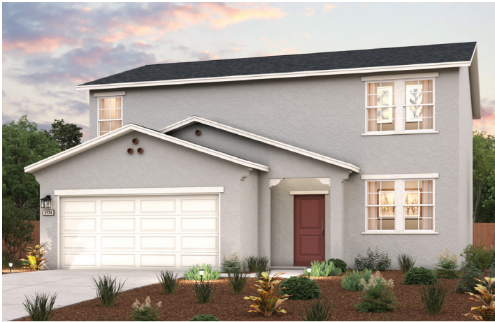
ELEVATION A - EARLY CALIFORNIA

APPROX. 2,174 SQ. FT. | 2-STORY | 5 BEDROOMS | 3 BATHROOMS | 2-BAY GARAGE