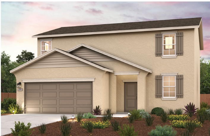
ELEVATION C - COTTAGE