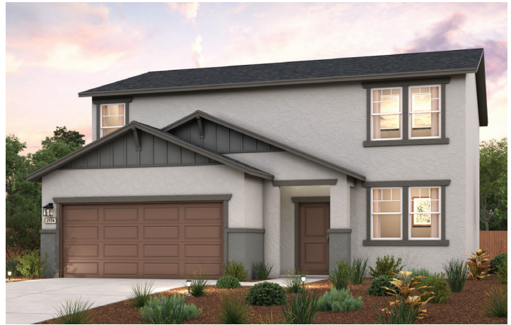
ELEVATION B - BUNGALOW