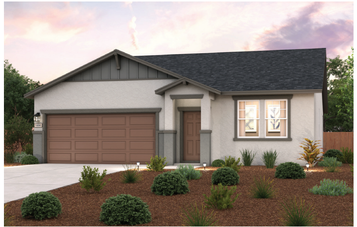
ELEVATION B - BUNGALOW