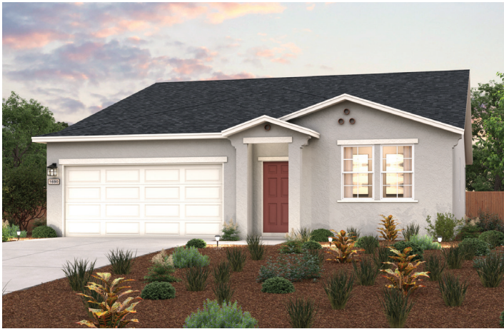
ELEVATION A - EARLY CALIFORNIA

APPROX. 1,690 SQ. FT. | 1-STORY | 4 BEDROOMS | 2 BATHROOMS | 2-BAY GARAGE