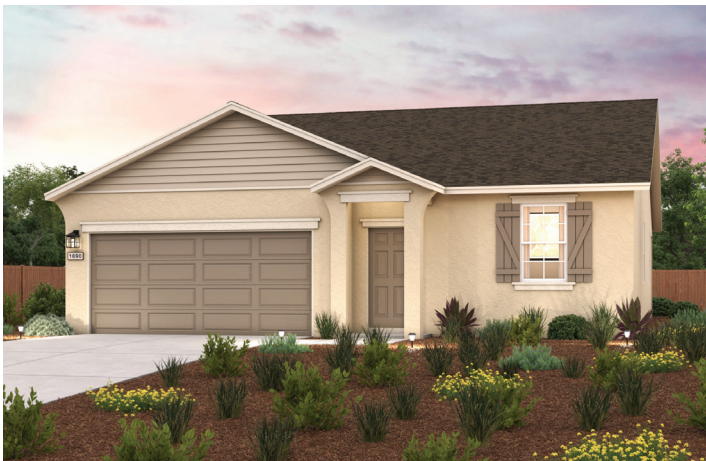
ELEVATION C - COTTAGE